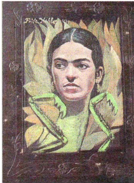
Mantis religiosa is part of the Noyola collection that will be the subject of two Dallas Art Fair symposiums.

● The “Finding Frida” symposiums will take place Saturday and Sunday from 10 a.m. to noon at the Montgomery Arts Theater at Booker T. Washington High School for the Performing and Visual Arts, 2501 Flora St. in the Dallas Arts District. “Finding Frida,” which features 20 items from the Noyola collection, is free with a ticket to the Art Fair (see pricing above).